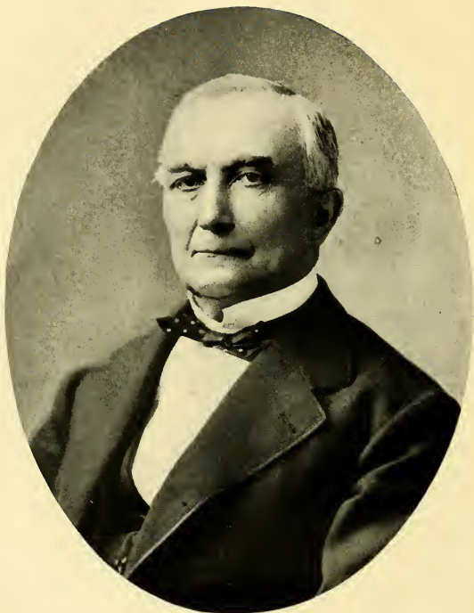
GOVERNOR PHILIP FRANCIS THOMAS