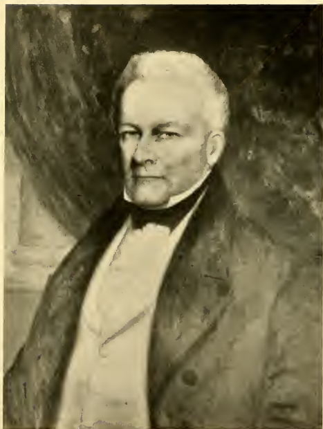
GOVERNOR EDWARD LLOYD