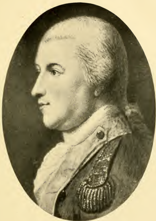
LIEUTENANT COLONEL TENCH TILGHMAN, WASHINGTON'S AIDE, WHO CARRIED THE OFFICIAL NEWS OF THE SURRENDER OF YORKTOWN